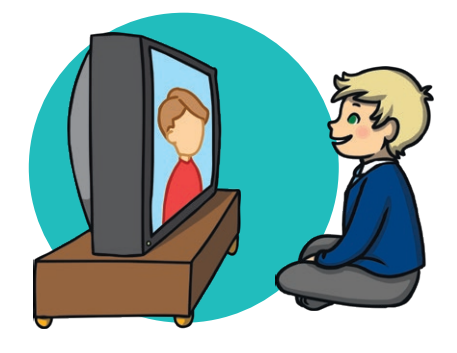
We should watch things that are OK for our age.

We should play games and use apps that are OK for our age.